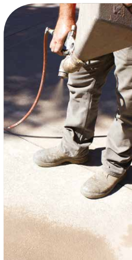
Hopper gun application of Stylepave.

Due to its great versatility in enabling multiple colours and designs to be incorporated into the project, it is becoming the system of choice for commercial and residential decorative concrete applications.