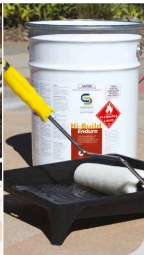
Two coats of a clear CCS Sealer provides protection against dirt and grime

Concrete Colour Systems or CCS is one of Australia's leading suppliers of applied decorative concrete products. It is a product group division of the fully Australian owned company, River Sands Pty Ltd. The company began in 1974 and now operates multiple production facilities and sales offices around Australia.